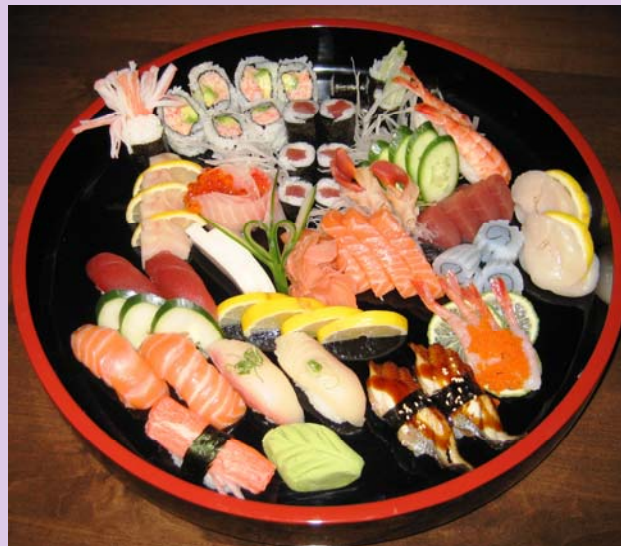
5609 CHARLIE CHIANG'S SPECIAL FOR 2 (10pcs Sushi, 1 California Roll, 16pcs Sashimi)

Consuming raw or undercooked seafood and shellfish may increase your risk of foodborne illness.